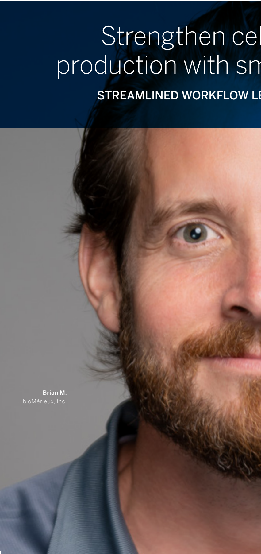
Brian M. bioMérieux, Inc.

STREAMLINED WORKFLOW LEADS TO IMPROVED PATIENT SAFETY